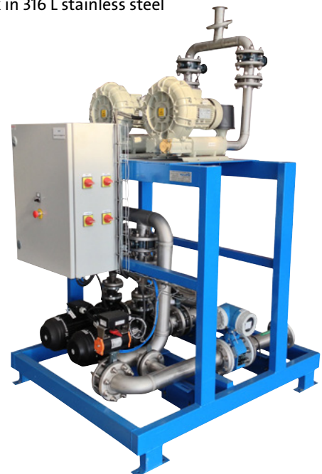
Backwash skid with pump and air blowers

For higher flow rates or other processes, consult your local Veolia Water Technologies representative.